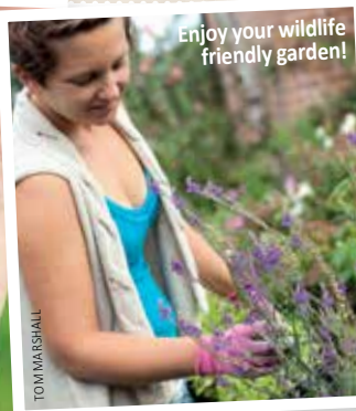
Enjoy your wildlife friendly garden!