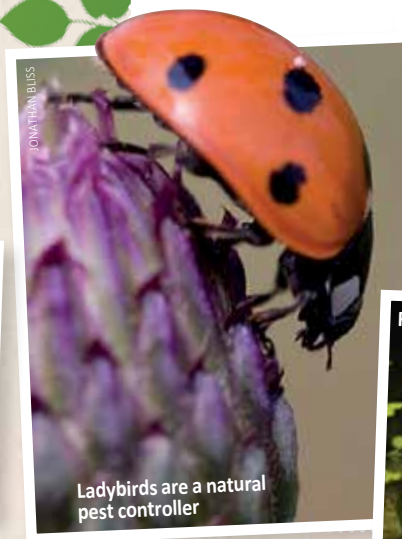
Ladybirds are a natural pest controller