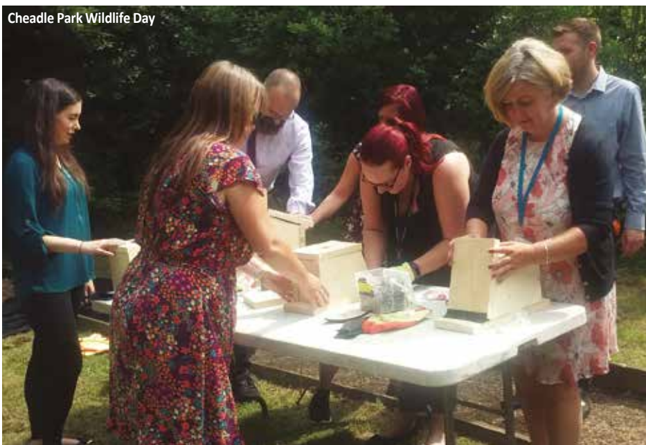
Cheadle Park Wildlife Day

See www.threehareschallenge.co.uk/ for more information.