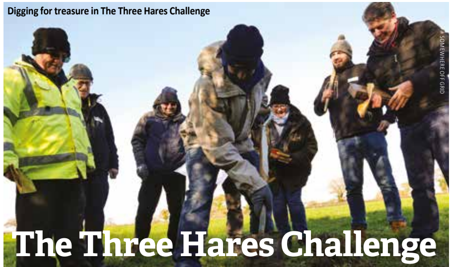
Digging for treasure in The Three Hares Challenge