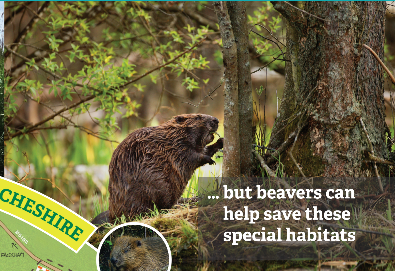
Hatchmere.

... but beavers can help save these special habitats