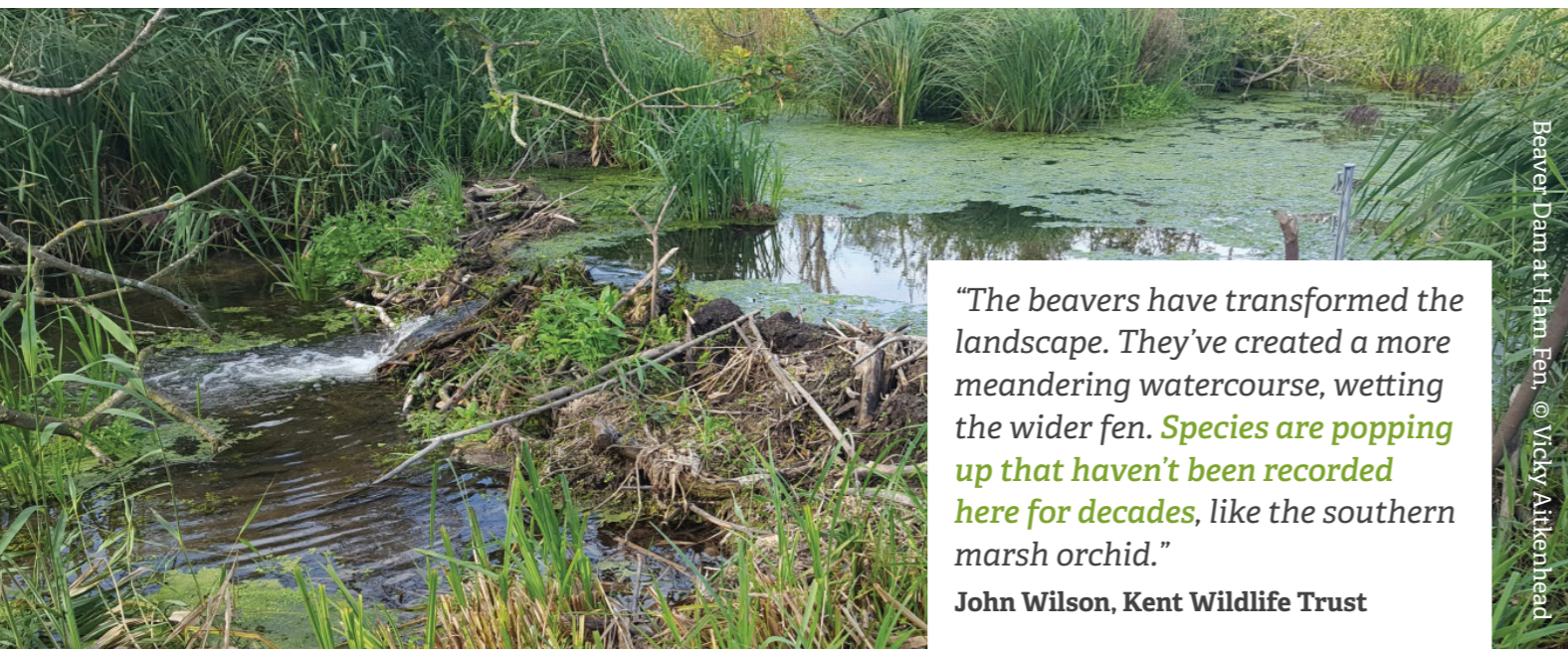
Beaver Dam at Ham Fen.

"The beavers have transformed the landscape. They've created a more meandering watercourse, wetting the wider fen. Species are popping up that haven't been recorded here for decades , like the southern marsh orchid."