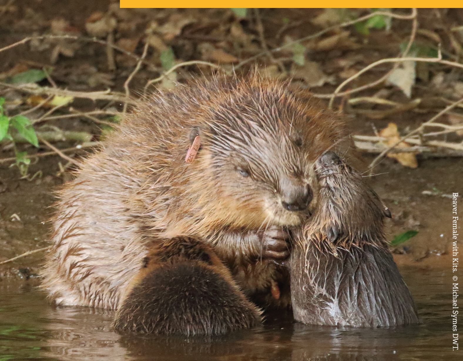
Beaver Female with Kits.