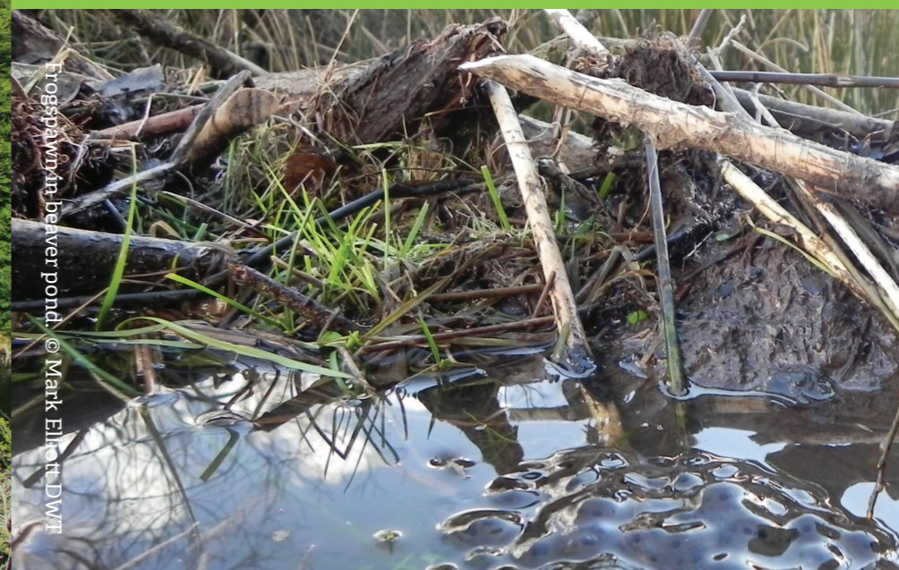
Prosperous beaver pond.

Funding: Viridor Credits Environmental Company and the Truell Charitable Foundation paid for the fencing costs and Westland Countryside Stewards funded the University of Exeter research work. The enclosure is also covered by a Higher Level Stewardship agreement.